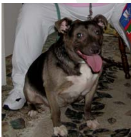
Former PAWS dog "Roo" is all smiles in her forever home.

1042 Benner Pike, State College, PA 16801